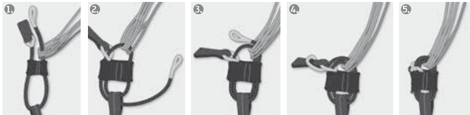
Soft link opening looks to the center of the glider

1. Thread the soft link through the riser, the elastic band and the lines.